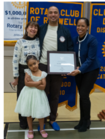
Frederick Levy Award for Hours of Service