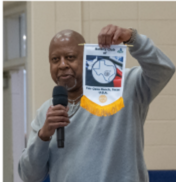
Go New Members!!!