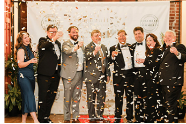
Thursday, March 6

Congratulations to these Rotarians for their well-deserved recognition!