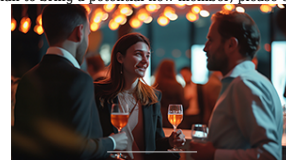
Friday, March 7